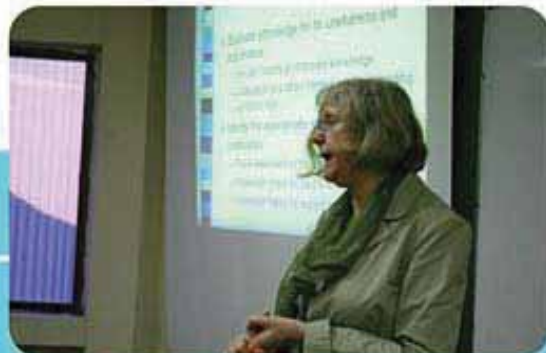
Guest Lectures by NU staff