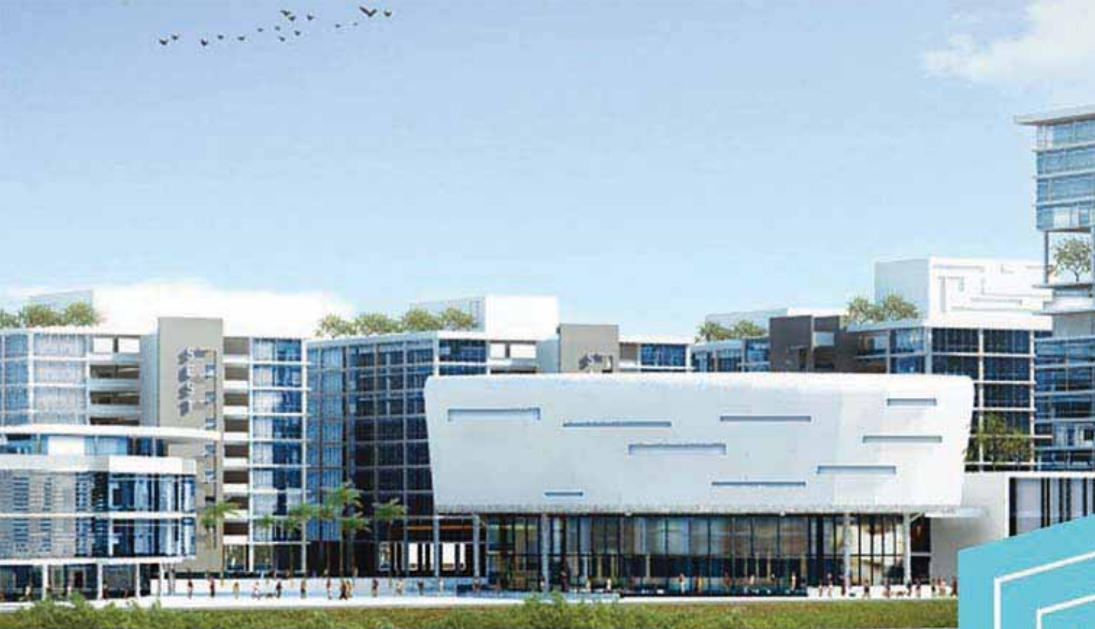
Artist impression of KDU University College Glenmarie campus. Scheduled for completion in 2014.