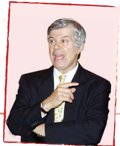
CEO, Paul Tiffany & Associates